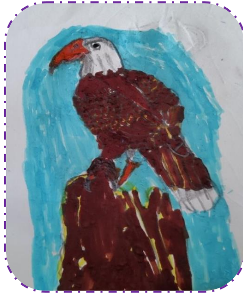
Akshith Grade 3