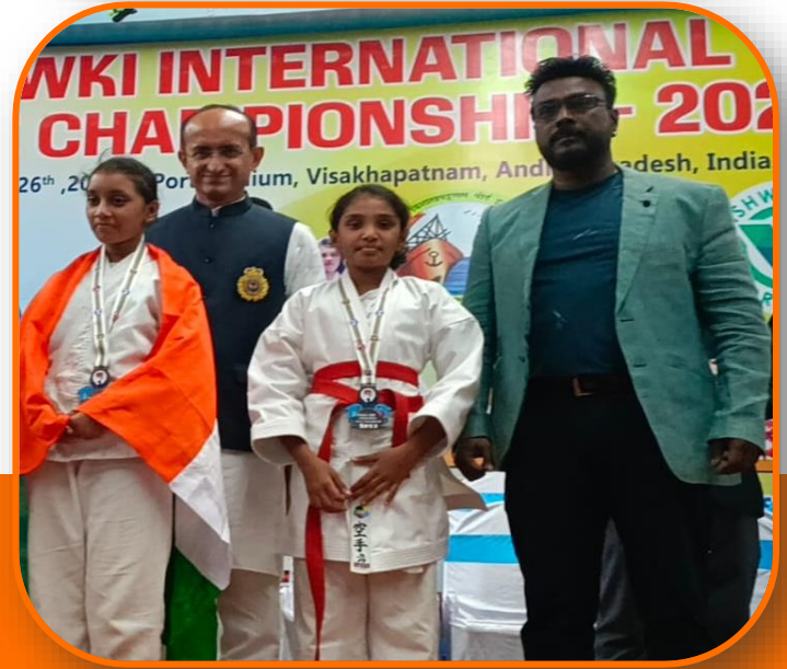
International Karate Competition